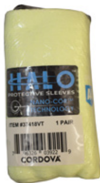
One Pair Vendpack

Nano-Cor® Technology: Glass & Steel Free, Moisture-Wicking Sleeves for Reliable Cut Resistance and Cool Comfort.