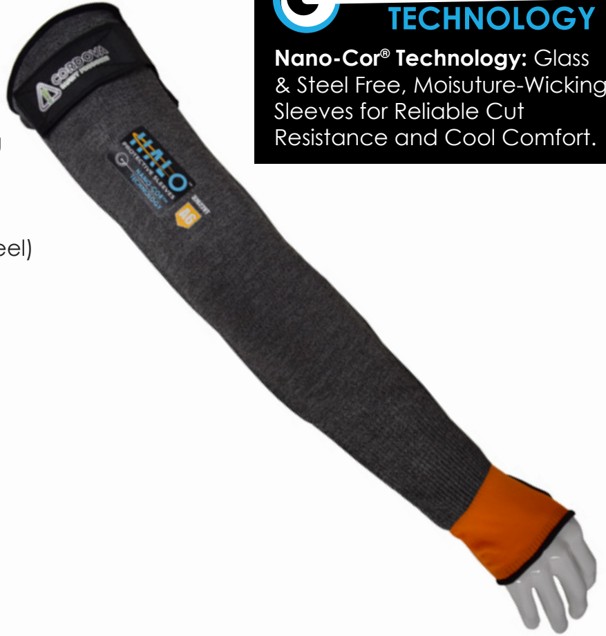
One Pair Vendpack