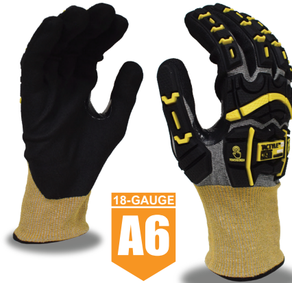
TACTYLE™ CR IMPACT | #6685TPR