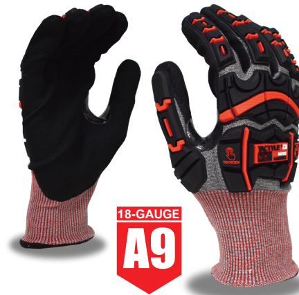
TACTYLE™ IMPACT | #6690TPR