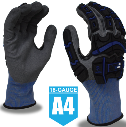
TACTYLE™ CR IMPACT | #6675TPR