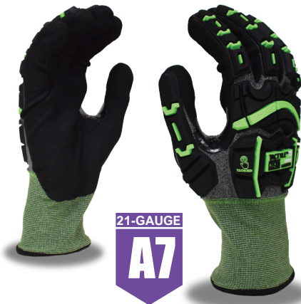
TACTYLE™ CR IMPACT | #6680TPR